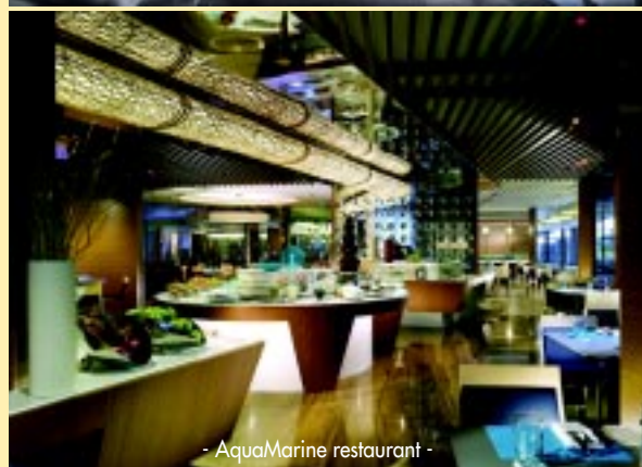
- AquaMarine restaurant -