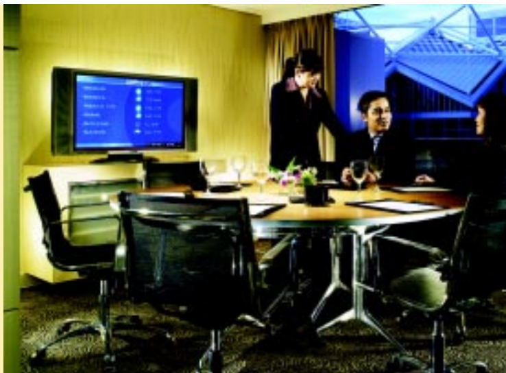
Services offered by the 24-hour Business Centre include private meeting room arrangements, secretarial and communication facilities such as facsimile, Internet, email and courier services.

screen Plasma television screens, central lighting and high-speed wireless broadband internet connectivity. This broadband facility known as Wi-Fi is also available in public areas other than the restaurants. The rooms come with a larger than normal writing desk.